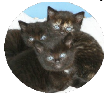
Scarlett's kittens, born in our care, currently looking for homes

People are not neutering their cats as often as they used to despite many organisations offering cut price neutering to help those people on low incomes. WHY? There are probably many reasons -