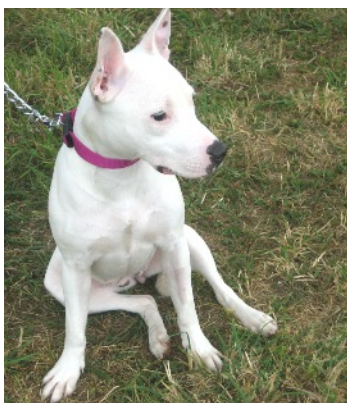
Ruby: neutered and rehomed

You might be saying to yourself 'I have had my animals done so I'm OK' but do you know anyone who isn't doing the right thing by the animals and allowing them to breed out of control and become a nuisance? If so think of the welfare of those animals, cats in particular, and contact your local RSPCA or another organisation in your area, including the local council that can help. ALL PETS, including rabbits, should be neutered.