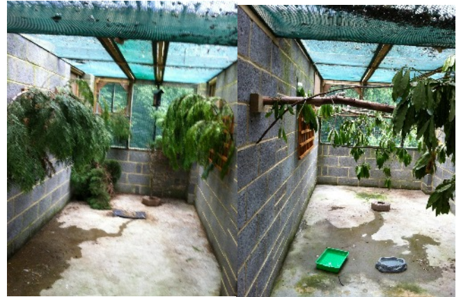
2 of the aviary runs viewed from inside through the small viewing holes in the doors